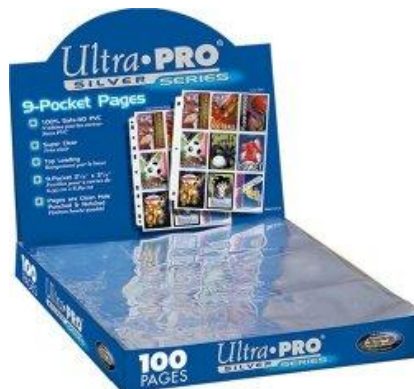
9-pocket plastic pages