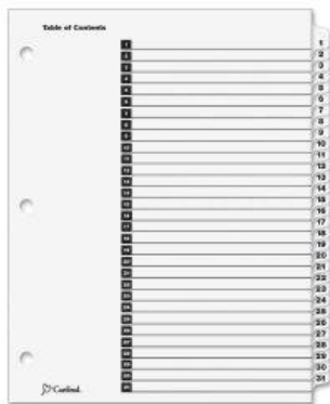
1-31 index dividers